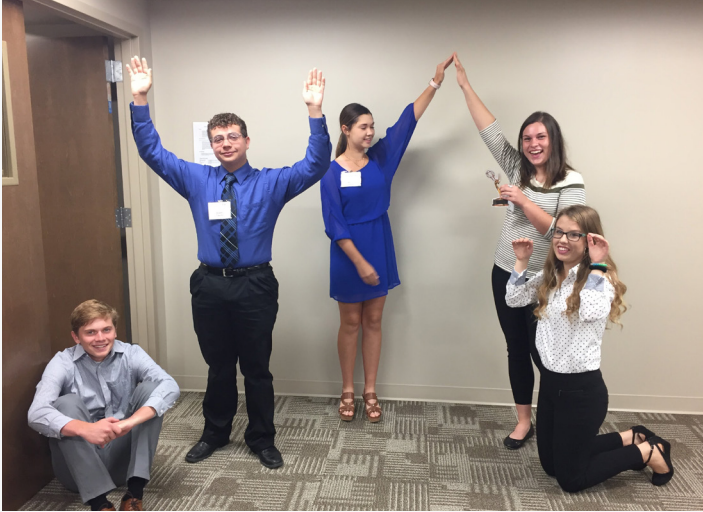
Best Group Performance: Orange Team for creating a house backdrop complete with trees, a bush and dog.

The As Seen on TV: Infomercials created were more than just an exercise in team building. The students participated in a live auction that was filled with miscellaneous items. The sales teams were then challenged to create a product and prepare an infomercial to sell it. A breakdown of each of the products developed was conducted. Each team was evaluated on Product Originality, Product Pricing, Creativity in Marketing Approach. The teams also analyzed how DISC personality traits played a role in the team's success. After analyzing the data the Green Team was declared the winner! Additional "Emmy's" were given for the creativity in the production.