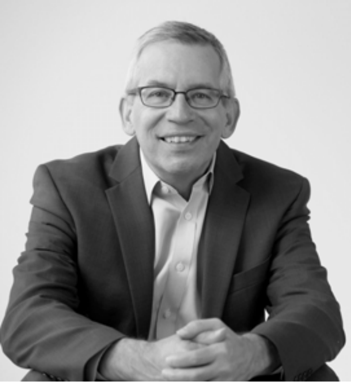
Sarah Petty Photography