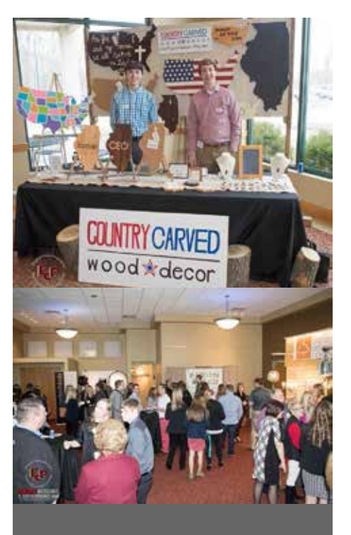
The CEO Experience also offered an alumni trade show to show the success of past CEO students. The five booths included Country Carved, SUBTL Leathers, Mette's Distinctive Lighting, Sutterfield Media, and Aherin Seed.